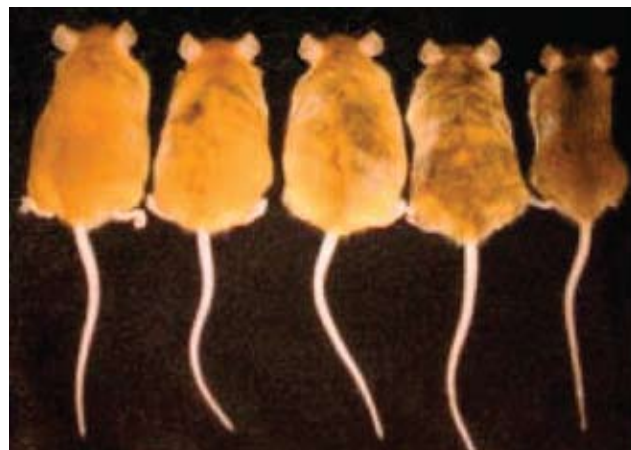
Figure 5. Dolinoy DC, et al., Environ. Health Perspect. 2006 Apr 114 (4): 567–72.