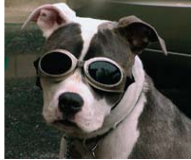
Marley, wearing his “doggles”

Since we all stand on the shoulders of those who have gone before us, sharing information is crucial. In that spirit, some of Marley's tissues were donated to the CCAH for research. To honor and memorialize him, we purchased a brick and a plaque to be displayed in the CCAH gardens, with the proceeds supporting lymphoma research. Many friends and relatives touched by Marley's life and story have also made contributions in his name.